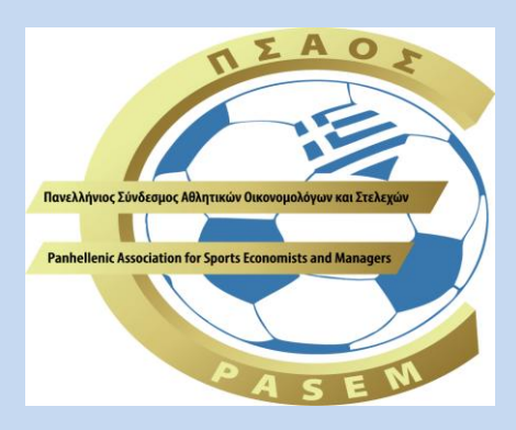
Panhellenic Association of Sports Economists & Managers (PASEM)